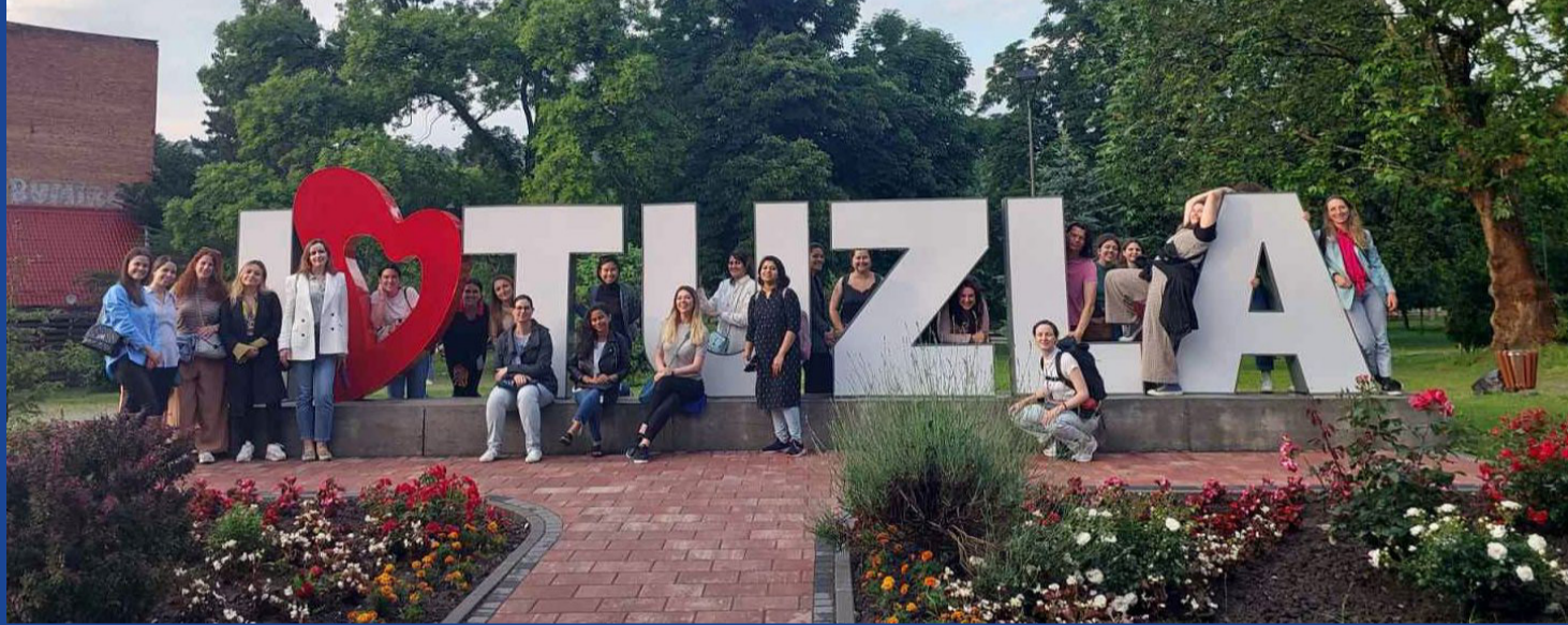
WEMov's second Training School in Bosnia & Herzegovina